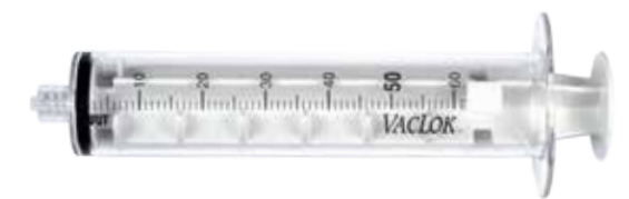
VacLok® Vacuum Pressure Syringe