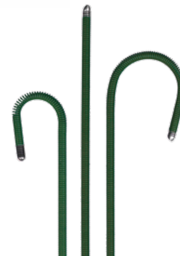
InQwire® Guide Wires