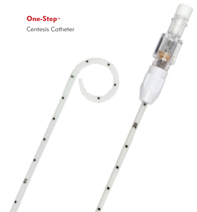
One-Step™ Centesis Catheter