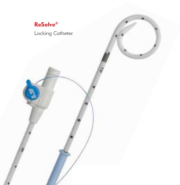
ReSolve® Locking Catheter